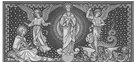
St. Mary of Fields Holy Hour Schedule 2 PM

Sunday, June 28th - Choir sings at 9:30 am